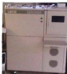
Glow Discharge Machine

Glow Discharge Spectrometer (GDS) is state of the art technology used to measure elemental variations and depth profiling of ferrous and nonferrous materials such as Stainless Steel, Aluminum, Brass, Unalloyed Copper to name a few.